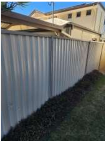
Site Area Photo